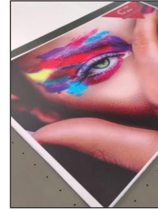
PVC board/KT board